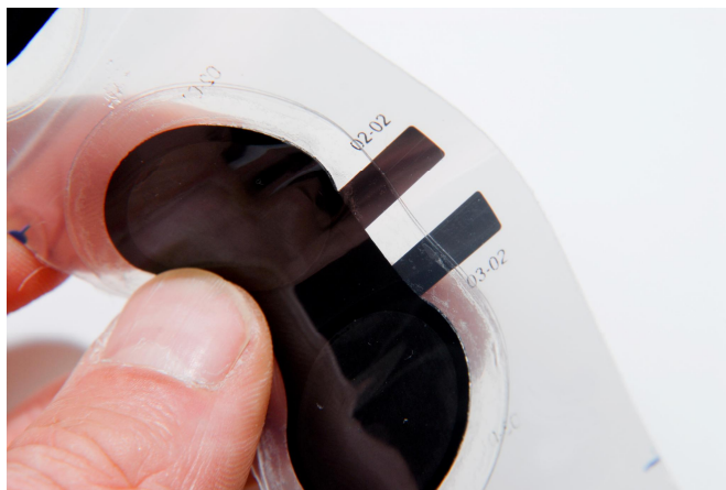
A typical flexible thin film battery

In 2010, this project is dedicated to Thin-Film Batteries made with zinc and bio-compatible laccase electrodes by the means of printing techniques. This approach focuses the expertise on ZnMn systems independently gained at TUC and ACREO as well as of VTT on laccase-based systems. The aim is to present the general printability of chosen electrodes and current collector materials. Also, the influence of manufacturing parameters on the morphology of produced layers and the performance of the manufactured hybrid cells are shown.